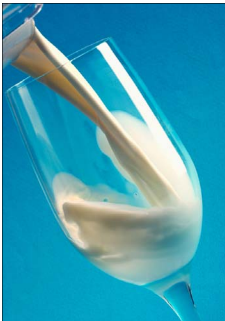
Nutrior is the "Champagne of Wheat Proteins"

Solubility. Digestibility. Acceptability. Nutrior ™ soluble wheat gluten protein (SWGPs) has all the attributes needed to enhance milk replacer composition and calf performance.